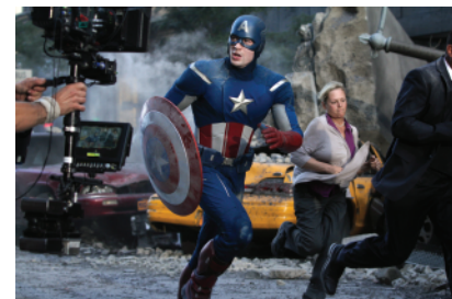
Chris Evans as Captain America in a scene for The Avengers (2012).

Construction Coordinator Construction Buyer Foreman Gang Boss Scenic Carpenter Metal Fabricator Welder Sculptor On-Set Carpenter Laborer Assistant